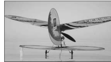
Shown with right stick pushed to the left.