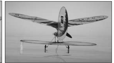
Shown with right stick pushed to the right.